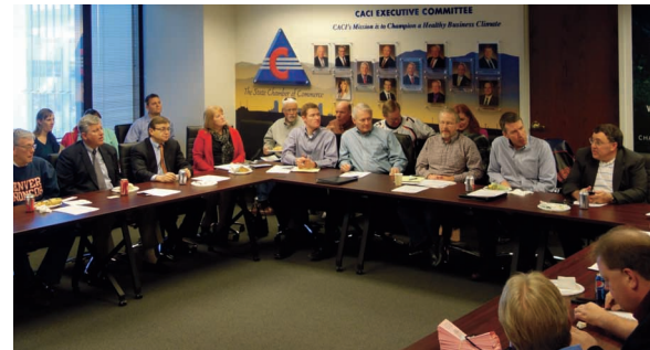
CACI members attend one of 26 Council meetings to advise and discuss policy matters with other members, Legislators, and agency officials.