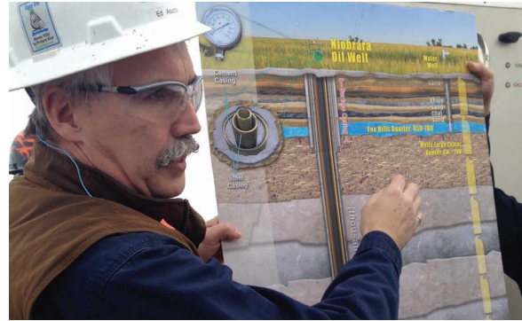
CACI opposed HB 1297 and supports responsible energy development in Colorado.