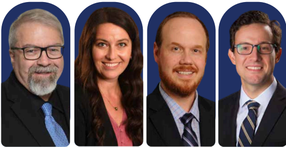
THE STRATACUMEN TEAM

The Colorado Chamber Foundation will continue to work with StratACUMEN to develop annual updates to key metrics from the regulatory report to educate the public on the state's economic climate.